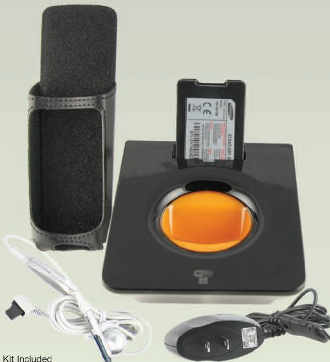
Accessory Kit Included